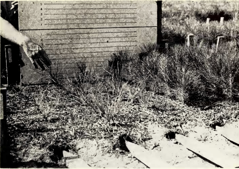
FIG. 5. Seedlings of Pinus hartwegii (on left) showing tendency toward a modified grass stage; seedlings of P. teocote (on right) showing normal growth in height and a basal crook in stem similar to shortleaf pine ( P. echinata ).

many fascicles containing only three needles instead of the normally expected five.